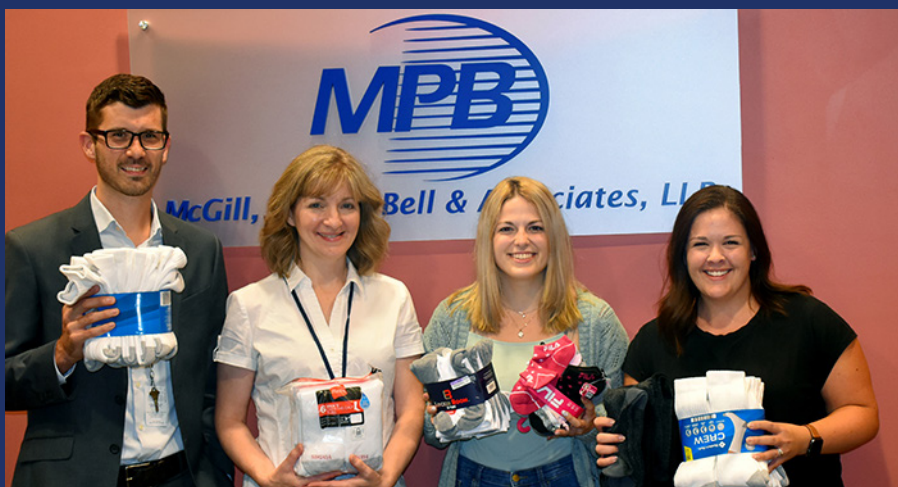
Employees at McGill, Power Bell & Associates held a sock drive to benefit Family Services of NW PA.